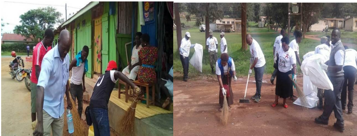
Local leaders in Pakwach (l) and Kabale ® participating in community cleaning as part of the Mayors' campaign

e) Sanitation Improvement: Under the WASH program priority, the urban authorities were engaged and reached out to a number of people with a variety of interventions to include: sensitization and awareness on sanitation improvement; roll-out of appropriate technology (Sato-pan) in partnership crest Tank.