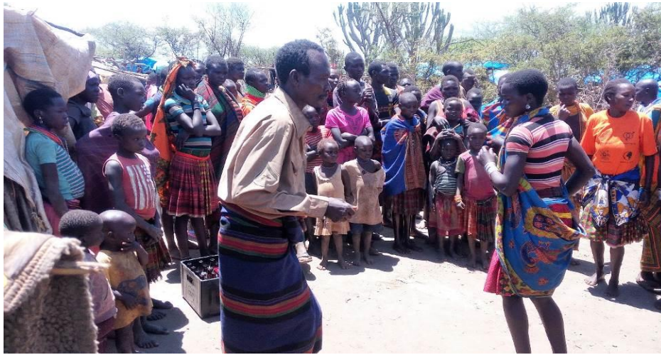
Drama Members performing during one of the organized camps in Nakabaat