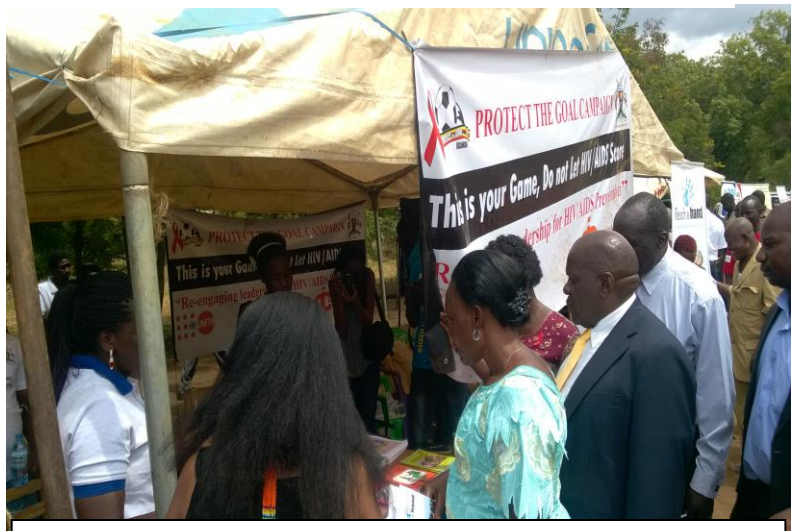
Minister of State for Karamoja Affairs, Hon Kizige Moses inspecting stalls during the launch of the PACK project in Moroto

a) Launch of PACK Project: The Prevention of HIV and AIDS in Communities of Karamoja (PACK) project was launched on 24 th November 2016 in Moroto. The launch was officiated by the Minister of State for Karamoja Affairs Hon. Kizige Moses and attended by over 300 people including; the political, cultural, and religious leaders. The five year project is funded by Irish Aid and implemented by a consortium of five national CSOs namely: AMICAALL, UNASO, NAFOPHANU, Straight Talk Foundation and TASO. AMICAALL's main focus is reduction of