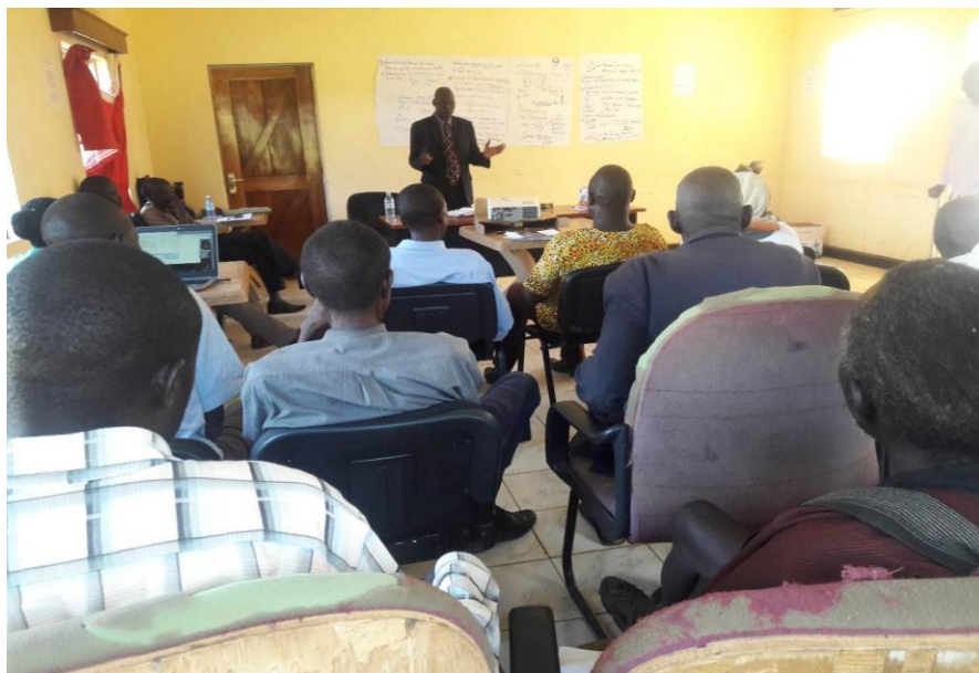
The CAO giving his remarks during orientation meeting in Kaabong

c) Training of peer educators; AMICAALL trained 155 (140 under PACK project and 15 under IOM project - from the mining sites and cross border points) peer educators. These were selected from amongst key populations, youths, migrants, boda boda cyclists, miners and the host communities in Karamoja. The trained peer educators were provided with data collections tools, T-shirts, certificate and facilitated with monthly stipend to conduct peer education, data collection and reporting. Through peer educators a total of 11,854 (6,487 males and 5,267 females) individuals among adolescent young people and key populations (CSWs, Boda boda riders, miners, truck drivers) and youth out of school in the 7 urban councils in Karamoja were reached with HIV prevention messages.