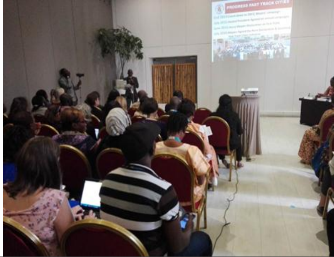
The Chairman (L) and Country Director (R) making presentations during the satellite symposium

d) Participation in ICASA 2017-Abidjan, Ivory Coast; The International Conference on AIDS and STIs in Africa (ICASA 2017) was hosted in Abidjan, Ivory Coast. AMICAALL Uganda was