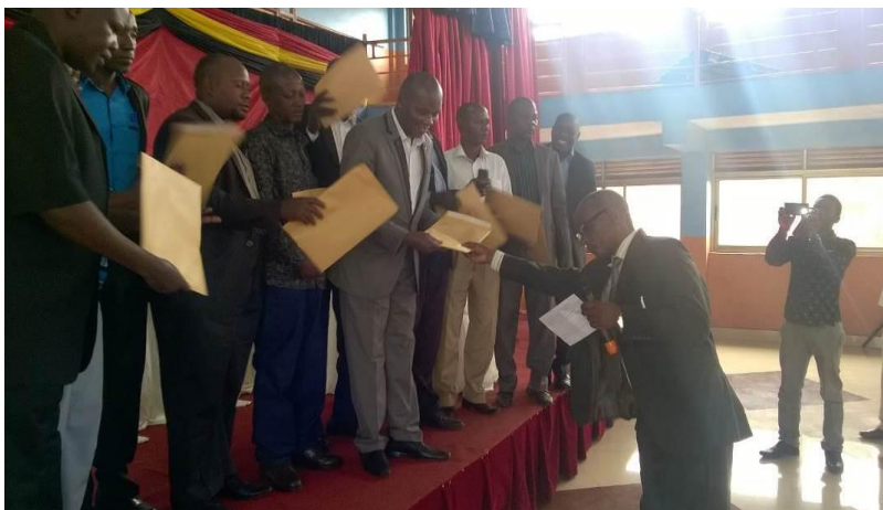
The RDC of Jinja officially handing over envelopes that contain Mayors' campaign documents as a sign of launching of the Eastern region Mayors' campaign

The best practices and lessons learnt from the experience of organizing this campaign were documented and shared during the