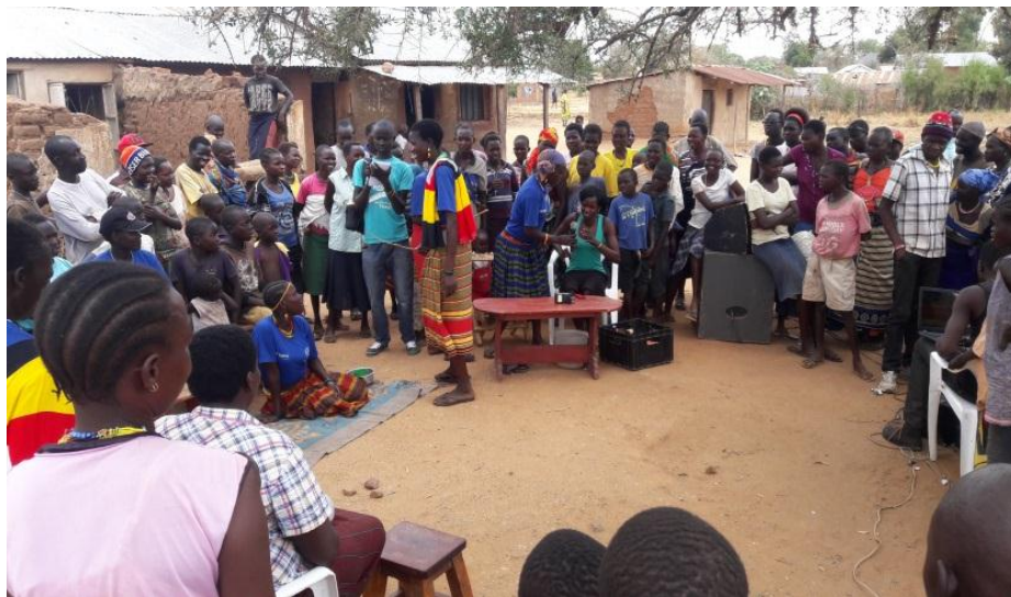
Kaabong Atosioma women drama group performing during an HCT outreach camp in Kaabong Town Council

c) Street jams: AMICAALL adopted street jams as a new strategy to mobilize the youths for HIV and SRH services. During the street jams, a lot edutainment activities such as musical performances, dance and role model presentation. In addition, HIV services such as HCT and condoms were provided during the outreaches. Seven (7) street jam events were conducted in all the urban councils of Karamoja to mobilize and sensitize the young people and key populations for HIV and SRH services.