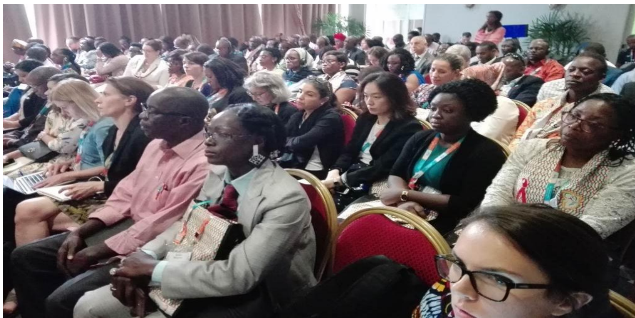
Delegates in the fully attended UNAIDS-AMICAALL Satellite session on Fast Track Cities Initiative

e) Dialogues meetings; A total of 23 dialogue meetings were held and 599 (317 Males and 282 Females) individuals among sex workers, miners, boda boda cyclists, truck drivers and youth out of school were sensitized on HIV and SRHR services and issues. AMICAALL worked with local leaders in Karamoja to identify individuals among the targeted beneficiaries that participated in the dialogues. The dialogue sessions were aimed at increasing awareness, risk perception and impacting comprehensive knowledge. During the dialogues, a number of misconceptions and emerging behaviors that could increase risk of HIV infections and affect treatment adherence were documented and addressed. These included;